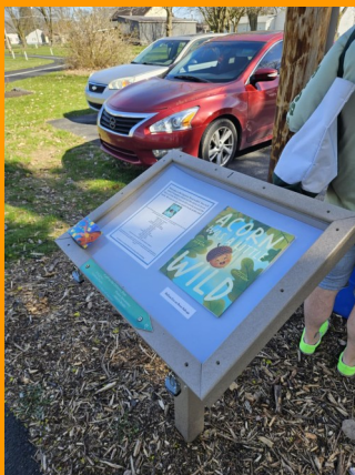
Check out the new book at the Storywalk, Acorn Was a Little Wild .